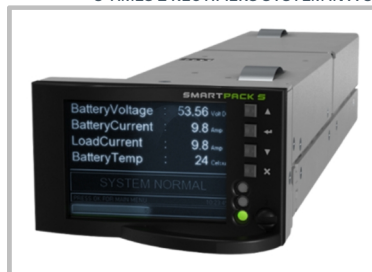
SMARTPACK S CONTROLLER