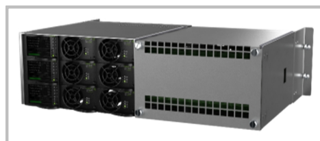
3 TIMES 2 RECTIFIERS SYSTEM IN A 3U RACK