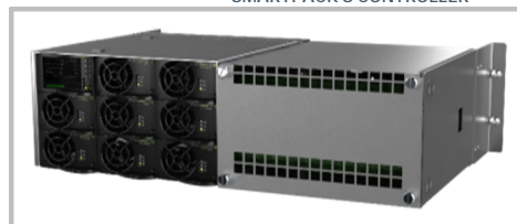
8 RECTIFIERS 3U SYSTEM - BULK OUTPUT